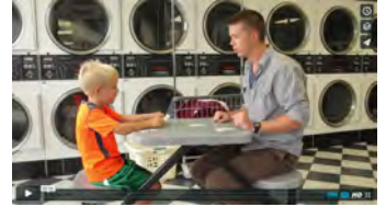
4-6 Year Old The Biggest Number