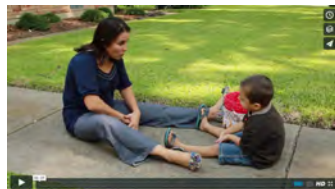
3-4 Year Old El Número se Queda Igual