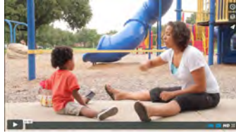
3-4 Year Old The Number Stays the Same