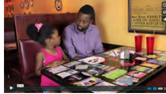
4-6 Year Old All Done