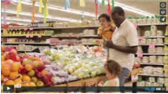
3-4 Year Old Letter Hunt