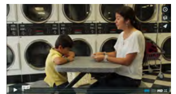
4-6 Year Old El número mayor

Register them in ReadyRosie or gather and confirm their contact info, preferred means of communication (email or text) and preferred language.