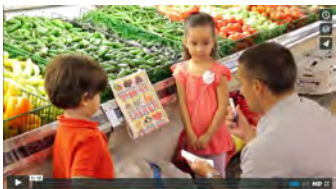
3-4 Year Old Caza de Letras