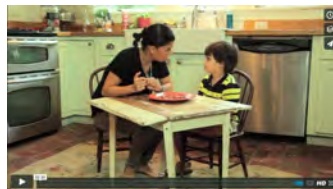
4-6 Year Old ¡Ya se Acabaron!